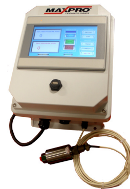
Pressure Data Logger